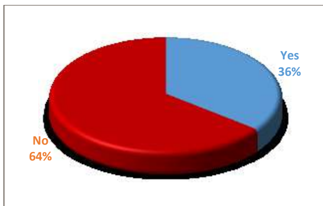
Figure 2. Ever Cheated in a test or an examination

Figure 2 shows that 96 (36%) respondents accepted, while 174 (64%) denied that they had ever cheated in a test or an examination. Two did not respond to this question.